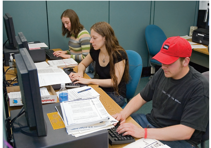
MSU Student employees work on retrospective processing of materials for the Turfgrass Information Center Database (TGIF).

The work performed by student employees is important and valued. A round of applause for the sheer amount of work and effort these students put forth; gratitude for all the researchers, students, and practitioners that helped via TGIF searches, archive sites and other TIC online resources; and thanks from all the staff at the Turfgrass Information Center.